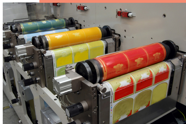
Inks for Flexographic Printing

Jaylink can be easily incorporated into a formula by dispersing it in a monomer that has strong solvency. Up to 30% of this additive can be dissolved in most acetate and ketone solvents. Jaylink is also soluble in acrylate monomers such as IBOA, NNDMA, NVP, EOEQEA, TMPTA, GPTA, PONPGDA, HDDA and TPGDA.